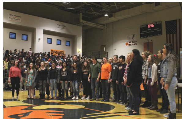
Choir...Singing our National Anthem