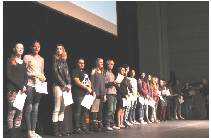
Students being recognized in the Auditorium for their 4.0 G.P.A.

On January 27th, GCHS & parents recognized those students who earned a 4.0 grade point average for the Fall semester. One hundred and three students were recognized for this outstanding achievement (9th—16 students, 10th—21 students, 11th—23 students, 12th—43 students)